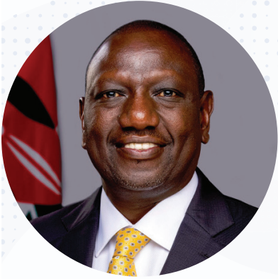
H.E. Dr. William Samoei Ruto ,C.G.H Commander in Chief and President of The Republic of Kenya