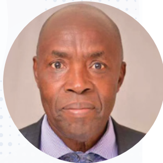
Hon. Ezekiel Machogu Cabinet Secretary, Education