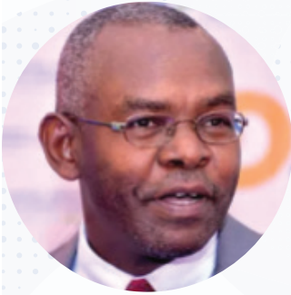
Dr Kamau Thugge Governor Central Bank of Kenya (CBK)