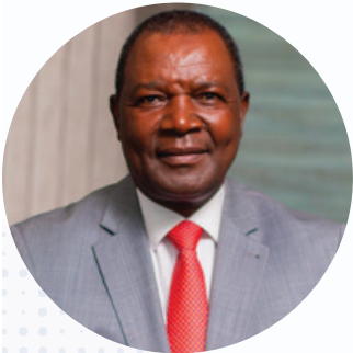
Prof. Njuguna Ndung'u Cabinet Secretary, National Treasury & Economic Planning