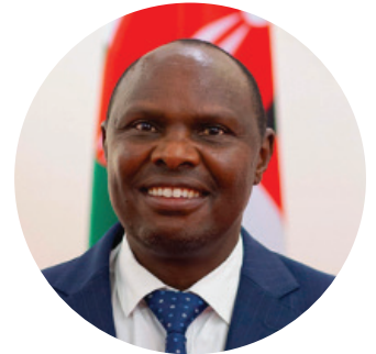
Mr. Felix K. Kosgei Chief of Staff and Head of Public Service